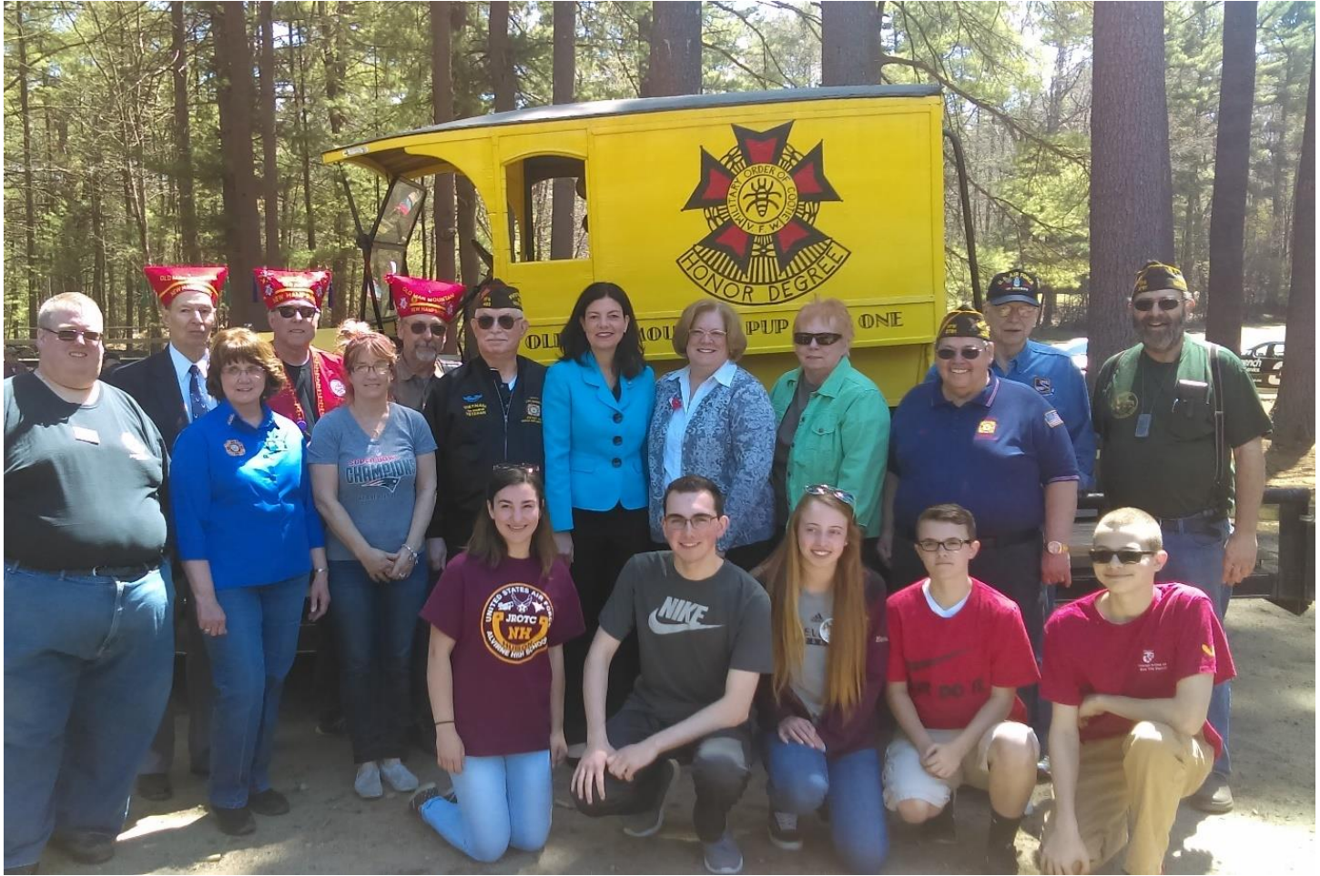
Cootie Wagon at Veteran Appreciation Day Hudson Fish & Game Club April 30, 2016 Cooties, Senator Kelly Ayotte, Hudson JROTC, et al