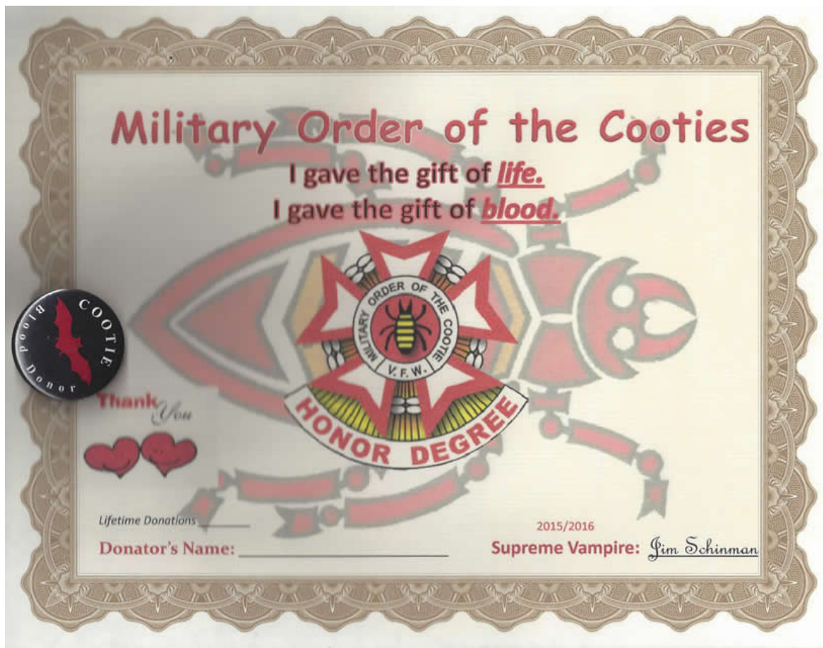
Certificate and Pin for BLOOD Donations

Yours in LOTCS Your Supreme Vampire Jim Schinman