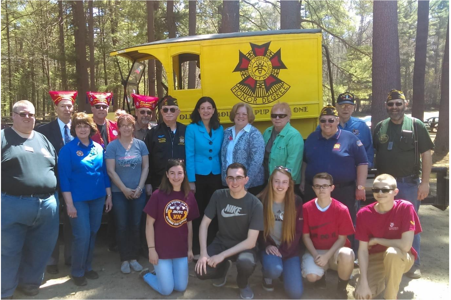
Cootie Wagon at Veteran Appreciation Day Hudson Fish & Game Club April 30, 2016 Cooties, Senator Kelly Ayotte, Hudson JROTC, et al